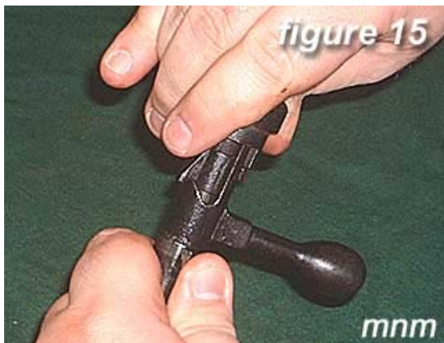
15) Push down on the bolt end piece and turn it clockwise until it stops.