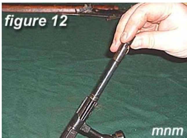
12) Place the striker and spring in the bolt .