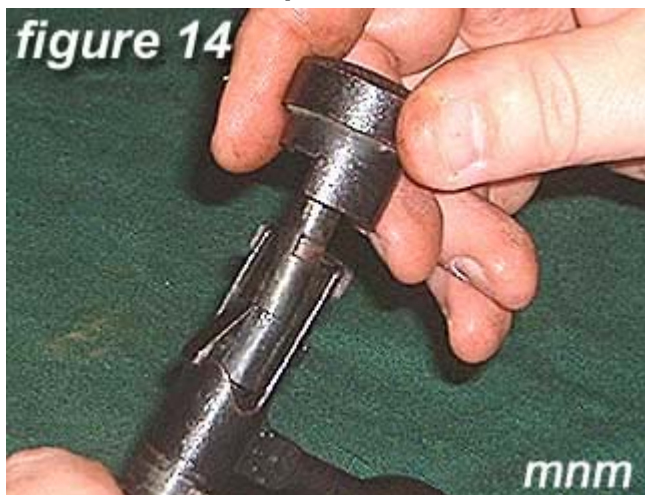
14) Align the lug on the bolt end piece and slide it into the striker .