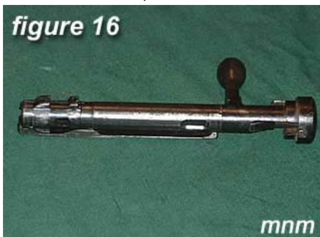
16) Figure 16 shows the reassembled bolt.