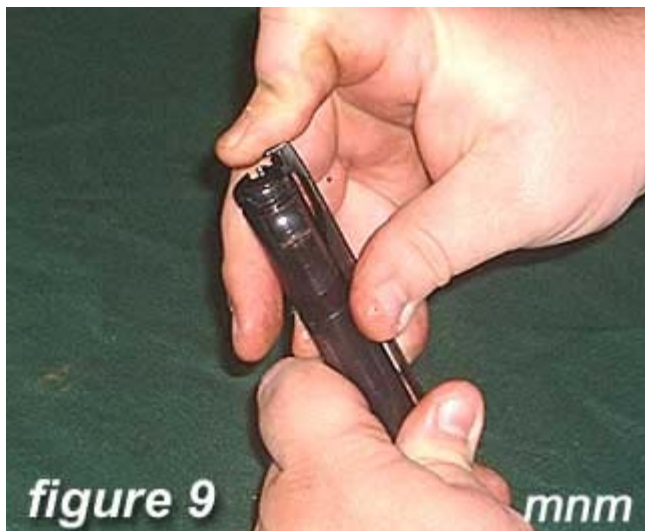
9) Slide the extractor back onto the mounting ring .