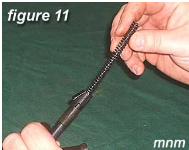
11) Place the spring into the striker .