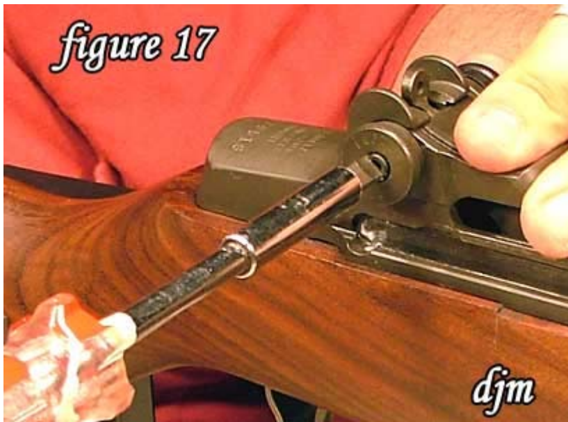
17) Tighten the windage knob nut.