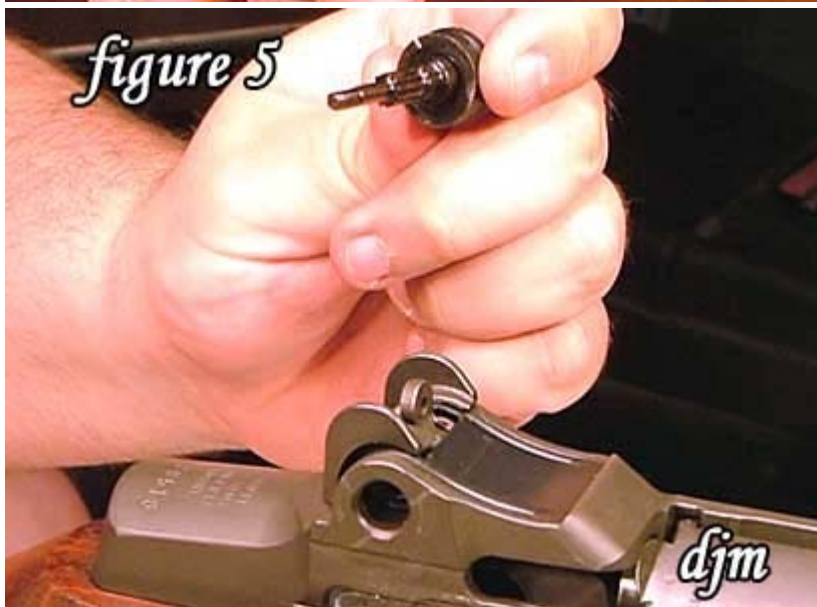
5) Remove the elevation knob.