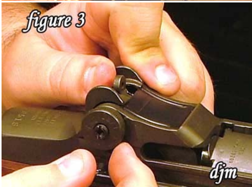
3) Unscrew the windage knob.