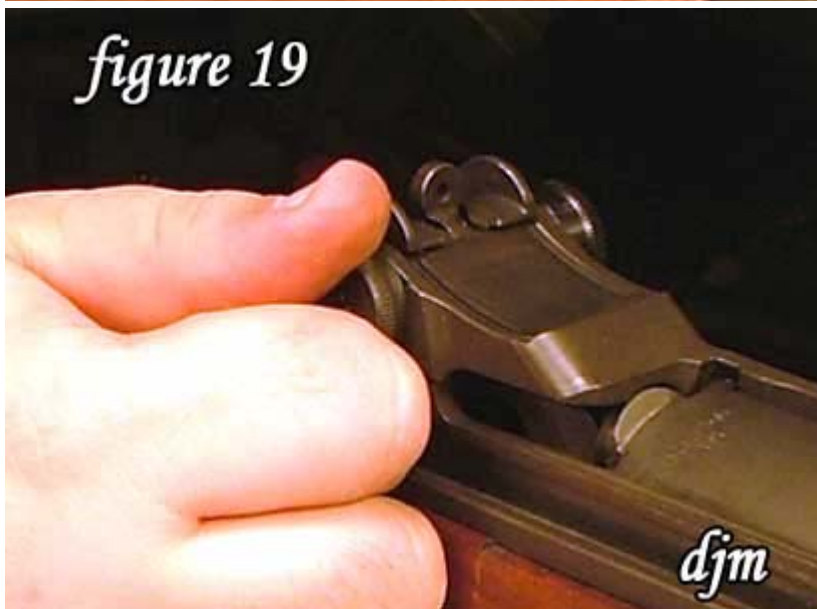
19) Operate the windage knob to make sure it functions without binding.

Adobe PDF Downloadable Version of Article