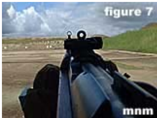
Figure 7 shows the front and rear sights. The rear sight is an easy to use aperture type and the front is very similar to the Mosin-Nagant 1891/30 hooded sight with a small post.